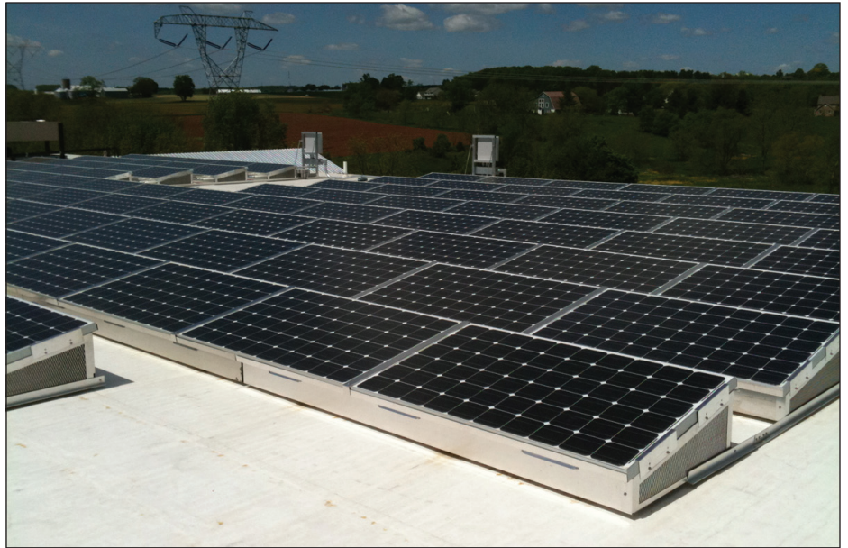
Moore Energy roof mounted system at a local manufacturing plant.

Last year, Moore Energy further enhanced its presence in the solar market by starting a new solar racking company: PV Racking LLC. PV Racking designs, manufactures and distributes solar racking components to be used in roof and ground mounted solar systems. PV Racking has revolutionized solar racking systems with its distinguishable "No Clamp" system which is more secure, superior