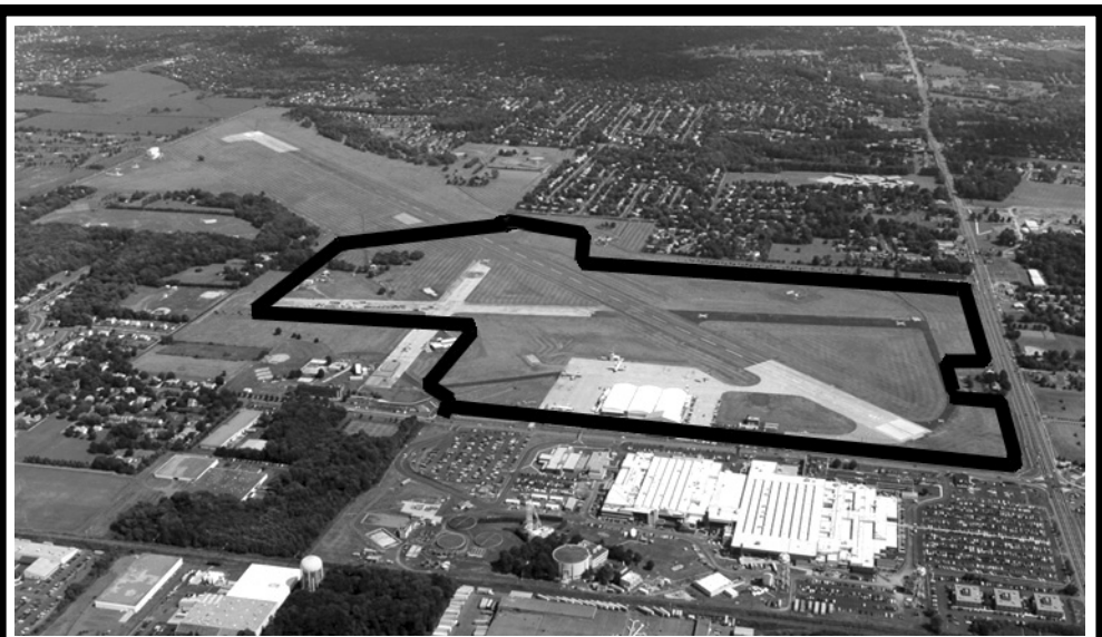
The North American Technology Center, as seen from the sky to the west. The 202 acre area purchased by Erickson Retirement Communities is outlined in black. Street Road (Rt. 132) can be seen to the right of the property, running southeast toward Southampton. To the upper left is 240 acres granted to Warminster Township for parks and recreational usage. At the bottom is the former research/hangar complex, purchased and renovated by Industrial Investments, Inc.

The FLRA will reinvest the proceeds from the Erickson sale into infrastructure improvements and business attraction